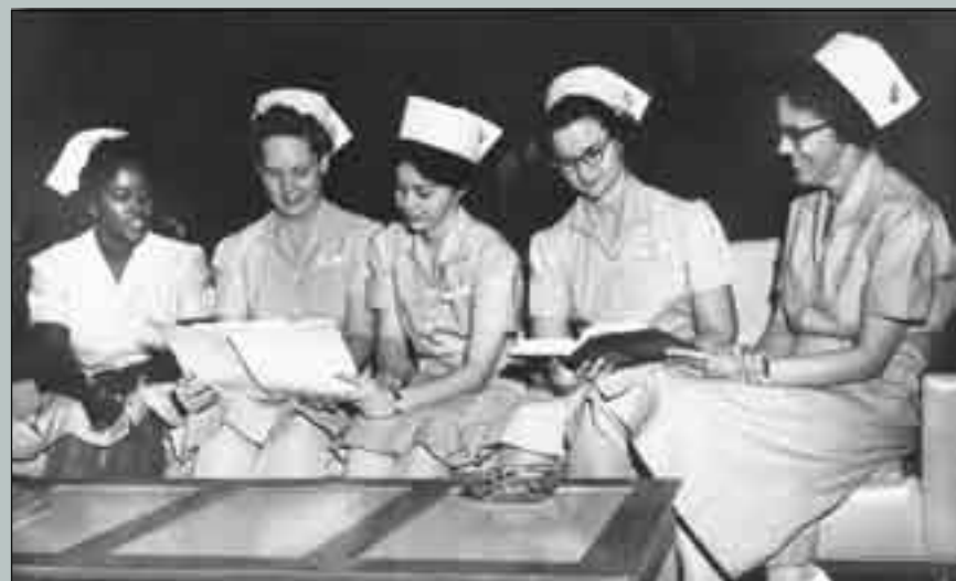
BC student nurses gain instruction in the 1960s.